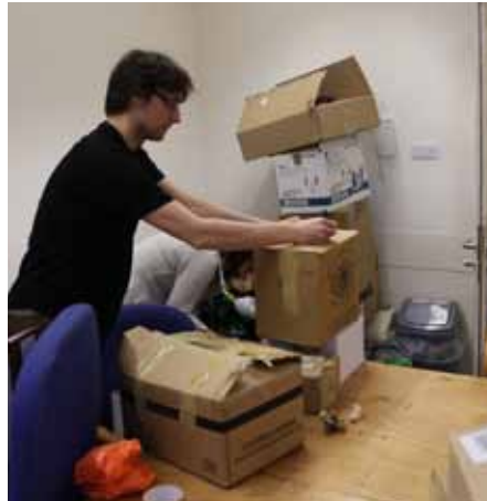
Top left: Holiday Food Drive boxes. Above: Holiday Food Drive sorting. Left: Holiday Food Drive sorting.